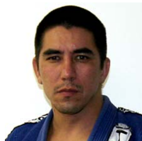
BJJ BLACK BELT